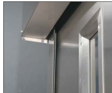
COMPLETE STAINLESS PACKAGE Provides the ultimate in sealing and cleanability.