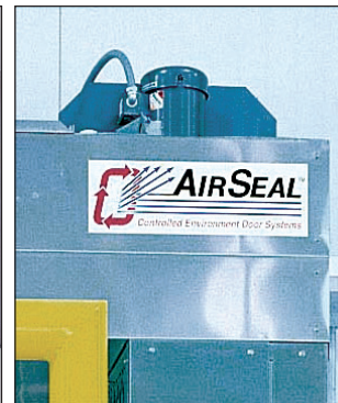
DIRECT DRIVE MOTOR