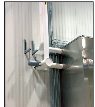
OPTIONAL WASTE HEAT RECLAIM