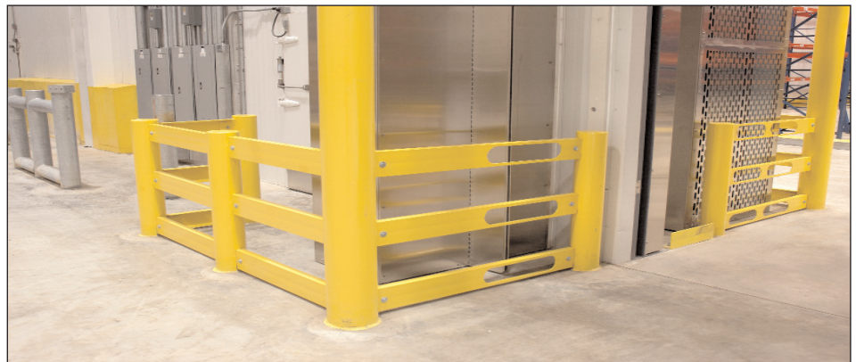
OPTIONAL BOLLARDING AND THRU-GUARDING