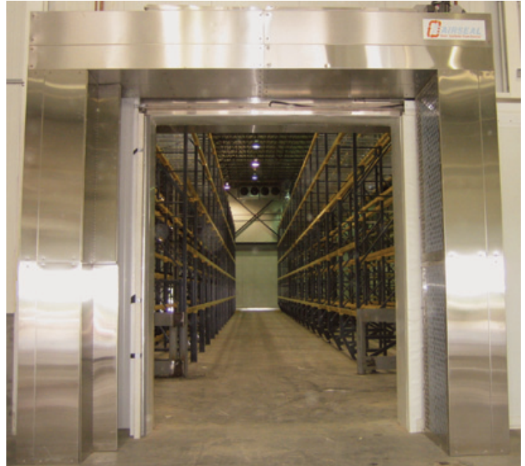
Shown with optional stainless steel construction.

Innovative Design. Superior Quality. Exceptional Value.