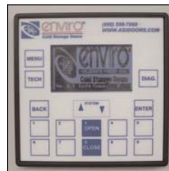
DIGITAL DISPLAY WITH SELF-DIAGNOSTICS