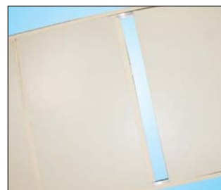
OPTIONAL REPLACEABLE BOTTOM PANEL SECTIONS