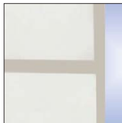
FULL PERIMETER REPLACEABLE CAPPING WITH INTEGRATED GASKET SEALS