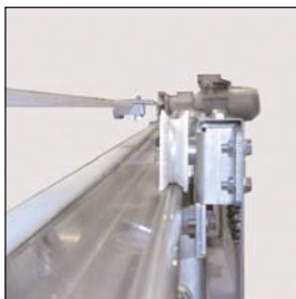
STANDARD XP SERIES HEADER AND RAIL ASSEMBLY