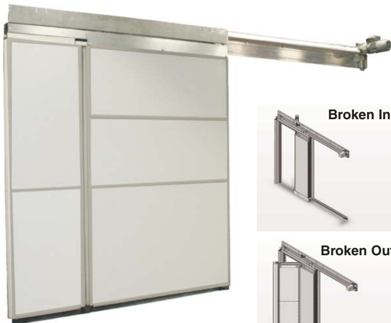
Power Model shown.

Designed for high cycle operation, every aspect of the IXP door was engineered to eliminate maintenance and downtime. The entire door system requires no lubrication and has no metal-to-metal contact eliminating wearing surfaces. The door's complete gasket release travel design, no wood construction, simple quick connect heat, and one-piece gasket system, virtually eliminates maintenance.